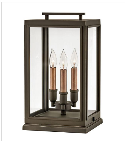
29170Z-LV MEDIUM PIER MOUNT LANTERN 12V 10.3" W, 18" H Socketed