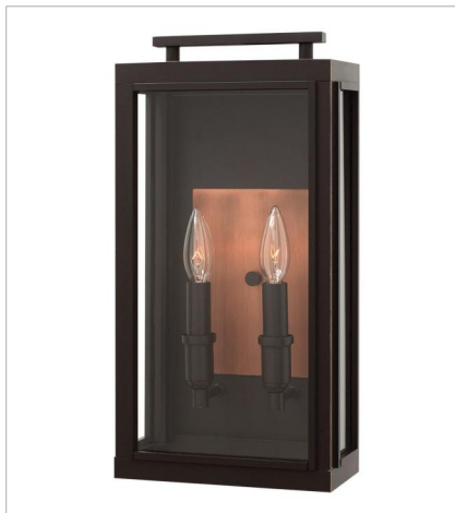
29140Z MEDIUM WALL MOUNT LANTERN 9" W, 17" H Socketed 2-5w Cand. LED, 60w Equiv.