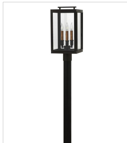
29110Z LARGE POST TOP OR PIER MOUN... 10" W, 20" H Socketed 3-5w Cand. LED, 60w Equiv.