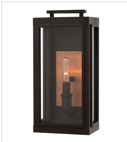
29100Z SMALL WALL MOUNT LANTERN 7" W, 14" H Socketed 1-5w Cand. LED, 60w Equiv.