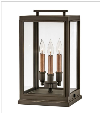
29170Z LARGE PIER MOUNT LANTERN 10.3" W, 18" H Socketed 3-5w Cand. LED, 60w Equiv.