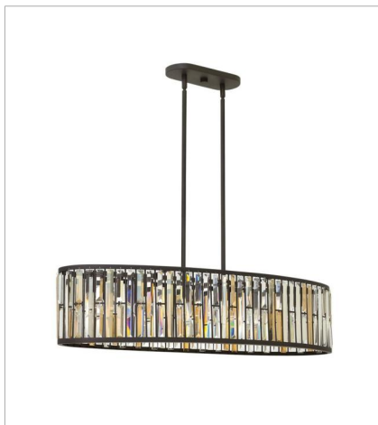
FR33738VBZ SIX LIGHT LINEAR 45" W, 10.3" H Socketed 6-14w Med. LED, 100w Equiv.