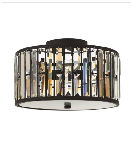
FR33731VBZ MEDIUM FLUSH MOUNT 16.5" W, 9.3" H Socketed 3-14w Med. LED, 100w Equiv.