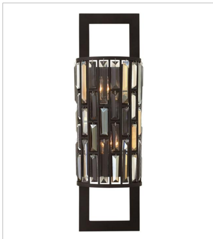
FR33730VBZ TWO LIGHT SCONCE 8" W, 25.5" H Socketed 2-5w Cand. LED, 60w Equiv.