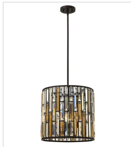
FR33734VBZ SMALL DRUM 16" W, 15.8" H Socketed 3-5w Cand. LED, 60w Equiv.