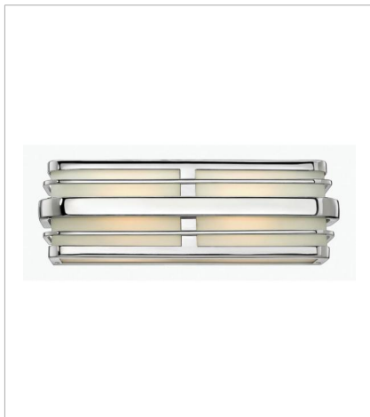
5232CM TWO LIGHT VANITY 15.5" W, 5" H Socketed 2-14w Med. LED, 100w Equiv.