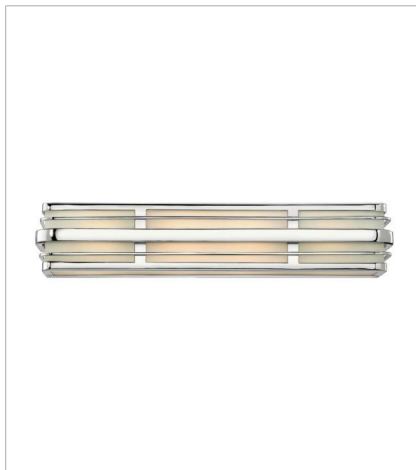
5234CM FOUR LIGHT VANITY 26.3" W, 5" H Socketed 4-14w Med. LED, 100w Equiv.