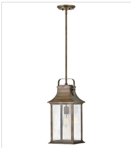
2392BU MEDIUM HANGING LANTERN 8.5" W, 19.8" H Socketed 1-12w Med. LED, 100W Equiv.