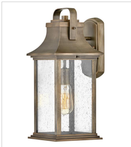
2394BU MEDIUM WALL MOUNT LANTERN 7.3" W, 16.8" H Socketed 1-12w Med. LED, 100W Equiv.