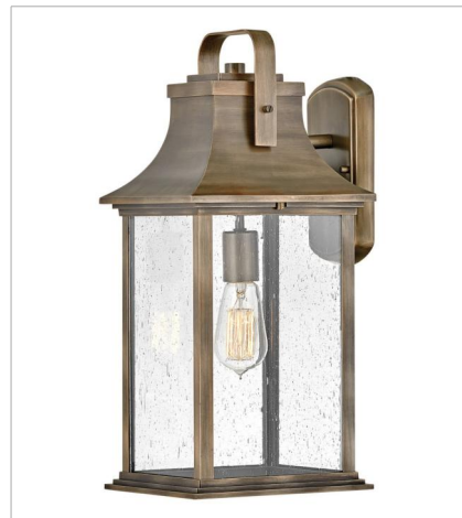
2395BU LARGE WALL MOUNT LANTERN 8.5" W, 19" H Socketed 1-12w Med. LED, 100W Equiv.