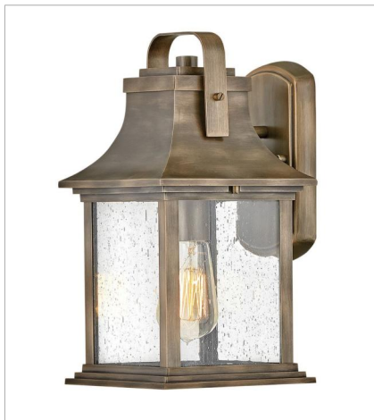
2390BU SMALL WALL MOUNT LANTERN 7.3" W, 13.8" H Socketed 1-12w Med. LED, 100W Equiv.

FINISH: Burnished Bronze GLASS: Clear Seedy