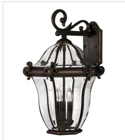
2445CB LARGE WALL MOUNT LANTERN 14" W, 20.8" H Socketed 3-5w Cand. LED, 40w Equiv.