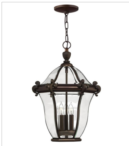
2442CB LARGE HANGING LANTERN 14" W, 20" H Socketed 3-5w Cand. LED, 40w Equiv.