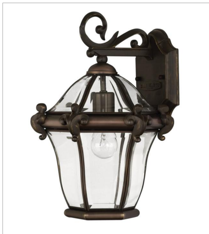
2440CB SMALL WALL MOUNT LANTERN 8.5" W, 13.8" H Socketed 1-10w Med. LED, 60w Equiv.

FINISH: Copper Bronze GLASS: Clear, Beveled and Bound