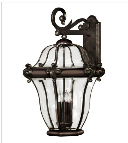
2446CB EXTRA LARGE WALL MOUNT LANTERN 17" W, 25.8" H Socketed 4-5w Cand. LED, 40w Equiv.