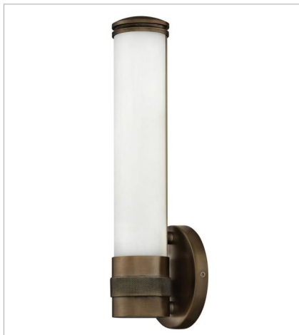
5070CR SMALL LED SCONCE 4.8" W, 14.3" H Integrated LED

FINISH: Champagne Bronze GLASS: Etched White