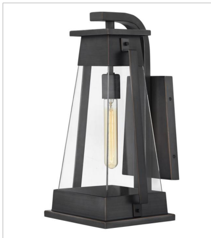
1135AC LARGE WALL MOUNT LANTERN 8.8" W, 18.5" H Socketed 1-12w Med. LED, 100W Equiv.