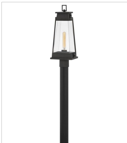
1137AC LARGE POST TOP OR PIER MOUN... 8.8" W, 21.8" H Socketed 1-12w Med. LED, 100W Equiv.