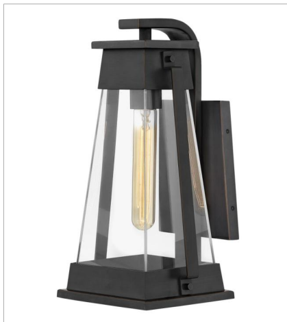
1134AC MEDIUM WALL MOUNT LANTERN 6.8" W, 14.3" H Socketed 1-12w Med. LED, 100W Equiv.