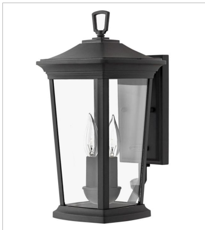
2360MB SMALL WALL MOUNT LANTERN 8" W, 15.5" H Socketed 2-5w Cand. LED, 60w Equiv.