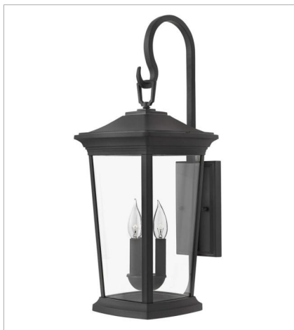
2366MB EXTRA LARGE WALL MOUNT LANTERN 10" W, 24.8" H Socketed 3-5w Cand. LED, 60w Equiv.