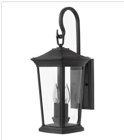
2364MB MEDIUM WALL MOUNT LANTERN 8" W, 20" H Socketed 2-5w Cand. LED, 60w Equiv.