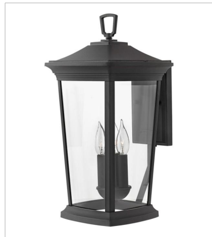
2365MB LARGE WALL MOUNT LANTERN 10" W, 19.3" H Socketed 3-5w Cand. LED, 60w Equiv.