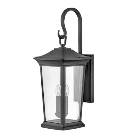
2369MB LARGE WALL MOUNT LANTERN 12" W, 30" H Socketed 3-5w Cand. LED, 60w Equiv.