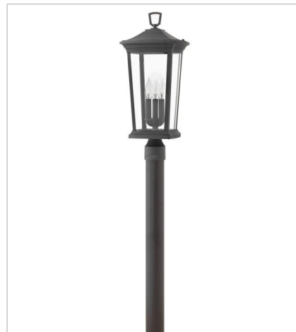
2361MB-LV LARGE POST TOP OR PIER MOUN... 10" W, 22.8" H Socketed