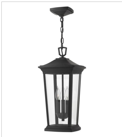
2362MB LARGE HANGING LANTERN 10" W, 19.3" H Socketed 3-5w Cand. LED, 60w Equiv.