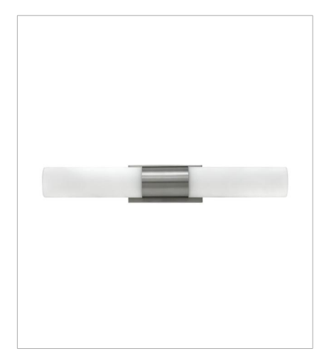
52112BN SMALL LED VANITY 19" W, 3" H Integrated LED

FINISH: Brushed Nickel GLASS: Etched Opal