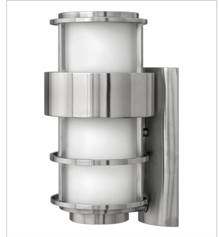
1904SS MEDIUM WALL MOUNT LANTERN 8" W, 16" H Socket 1-75w Med.