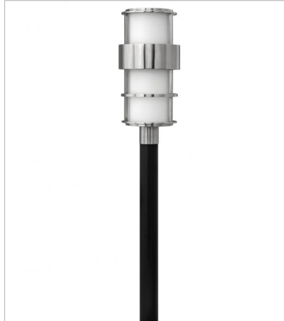
1901SS LARGE POST TOP OR PIER MOUN... 10" W, 21.8" H Socket 1-100w Med.