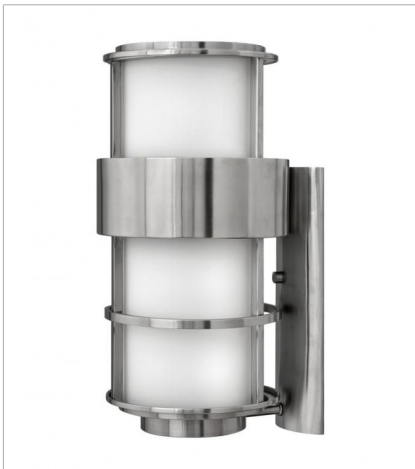
1905SS LARGE WALL MOUNT LANTERN 10" W, 20.3" H Socket 1-100w Med.