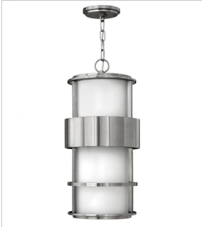
1902SS LARGE HANGING LANTERN 10" W, 21.3" H Socket 1-100w Med.

FINISH: Stainless Steel GLASS: Etched Opal