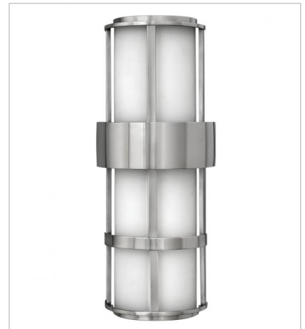
1909SS LARGE WALL MOUNT LANTERN 8" W, 20.5" H Socket 2-75w Med.