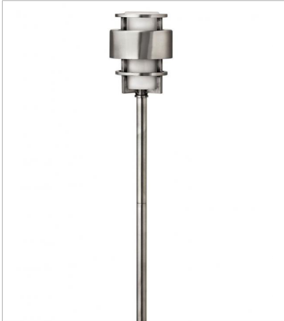
1579SS SATURN PATH LIGHT 4.5" W, 22.3" H Socket 1-18w T-5 Wedge *Included

FINISH: Stainless Steel GLASS: Etched Opal