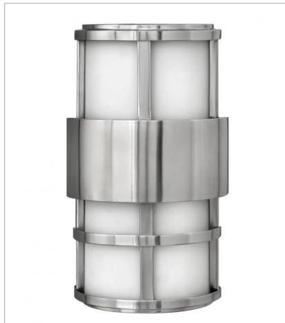
1908SS SMALL WALL MOUNT LANTERN 7.3" W, 12.5" H Socket 2-40w Cand.