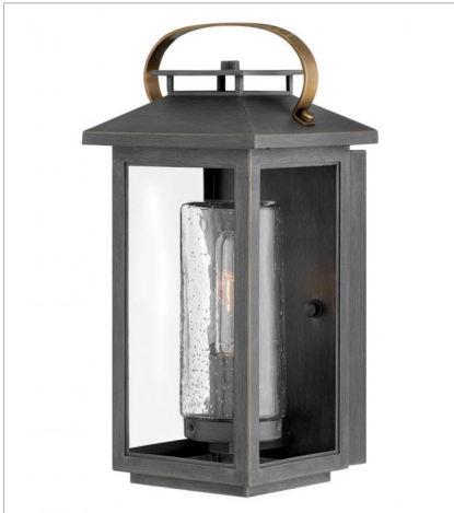
1160AH SMALL WALL MOUNT LANTERN 6.5" W, 14" H Socket 1-100w Med.