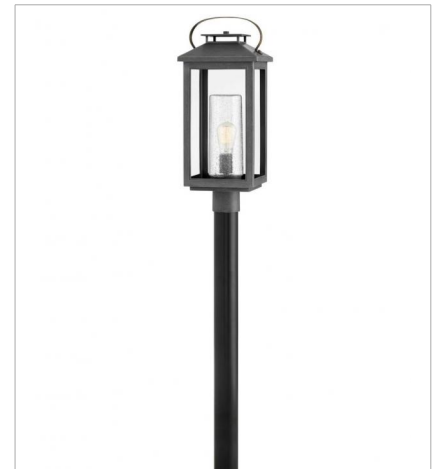
1161AH MEDIUM POST OR PIER MOUNT L... 9.5" W, 23" H Socket 1-100w Med.