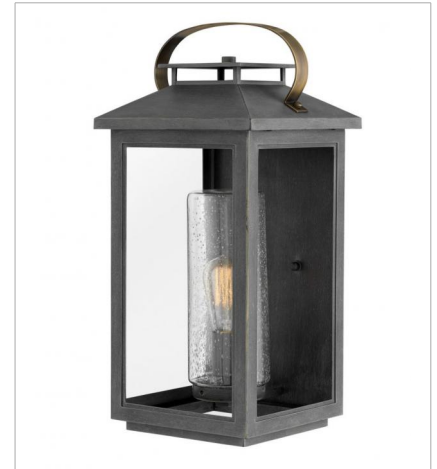
1165AH LARGE OUTDOOR WALL MOUNT LA... 9.5" W, 20.5" H Socket 1-100w Med.