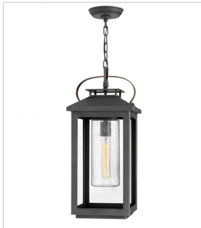
1162AH MEDIUM HANGING LANTERN 9.5" W, 21.5" H Socket 1-100w Med.