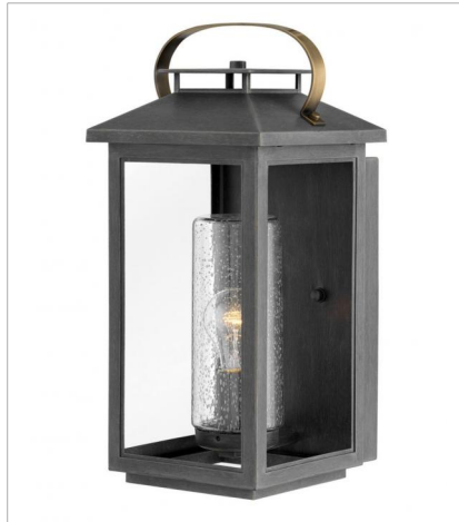
1164AH MEDIUM WALL MOUNT LANTERN 8.3" W, 17.5" H Socket 1-100w Med.