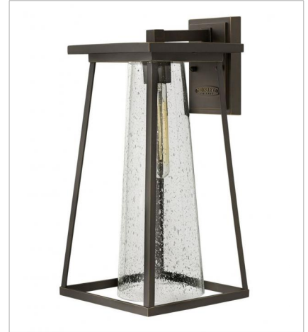
2795OZ-CL LARGE WALL MOUNT LANTERN 10.3" W, 18.5" H Socket 1-100w Med.