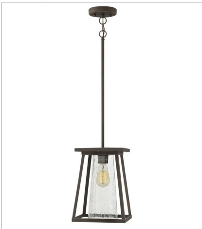
2792OZ-CL MEDIUM HANGING LANTERN 9" W, 13" H Socket 1-100w Med.