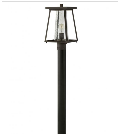
2791OZ-CL MEDIUM POST OR PIER MOUNT L... 9" W, 16" H Socket 1-100w Med.