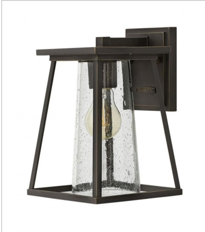
2790OZ-CL SMALL WALL MOUNT LANTERN 7.3" W, 10.8" H Socket 1-100w Med.

FINISH: Oil Rubbed Bronze with Clear glass GLASS: Clear Seedy