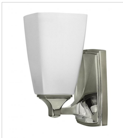
53010PN SINGLE LIGHT VANITY 5.8" W, 8.3" H Socket 1-100w Incan. OR 1-17w LED Med.

FINISH: Polished Nickel GLASS: Etched Opal