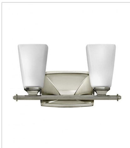
53012PN TWO LIGHT VANITY 14" W, 8" H Socket 2-100w Incan. OR 2-17w LED Med.