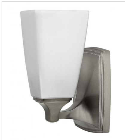
53010BN SINGLE LIGHT VANITY 5.8" W, 8.3" H Socket 1-100w Incan. OR 1-17w LED Med.

FINISH: Brushed Nickel GLASS: Etched Opal