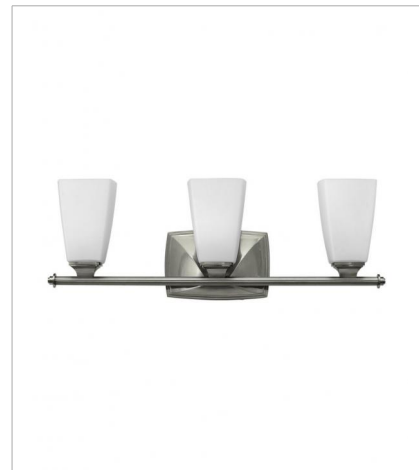
53013BN THREE LIGHT VANITY 23" W, 8" H Socket 3-100w Incan. OR 3-17w LED Med.