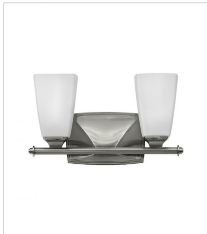
53012BN TWO LIGHT VANITY 14" W, 8" H Socket 2-100w Incan. OR 2-17w LED Med.